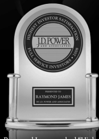
Raymond James ranked "Highest in Investor Satisfaction with Full Service Brokerage Firms." - J.D. Power & Associates

25 E. Liberty Lane | Danville, IL 61832 | 217-431-0307 | 877-650-5329 toll-free | 217-431-0885 fax