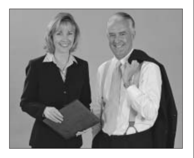
The Finkle-Lewis Team Morgan Stanley

Customized investment solutions for your portfolio